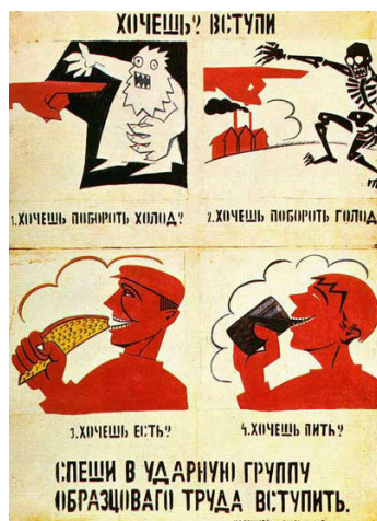
Agitprop poster by Vladimir Mayakovsky

During and immediately following the Russian revolution, artists, poets, musicians and other revolutionary intellectuals became seized with such hopes and dreams, letting their imaginations run wild. This was the period of cubo-futurism and constructivism – libertarian communist/anarchist movements