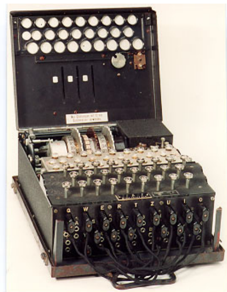
Inputs and outputs: the Enigma machine

political culture didn't just die at the end of the war. It lived on. When Chomsky took up linguistics before getting his job at MIT, it was with the encouragement of Zellig Harris, Roman Jakobson and a network of radicalised scientists and scholars in positions of influence, many of them refugees fortunate to have escaped the gas chambers