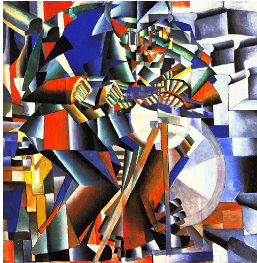
Kazimir Malevich, 'The Knife-Grinder'. 1912

he went quiet on hearing the terrible news about Hiroshima and Nagasaki. Yet the idea of science against the Nazis was central to the political ethos of the time, especially if – like Chomsky – you were left-wing and Jewish. And that